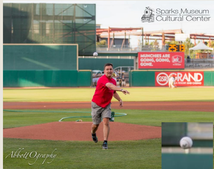
Aces Partnership Evening August 2015