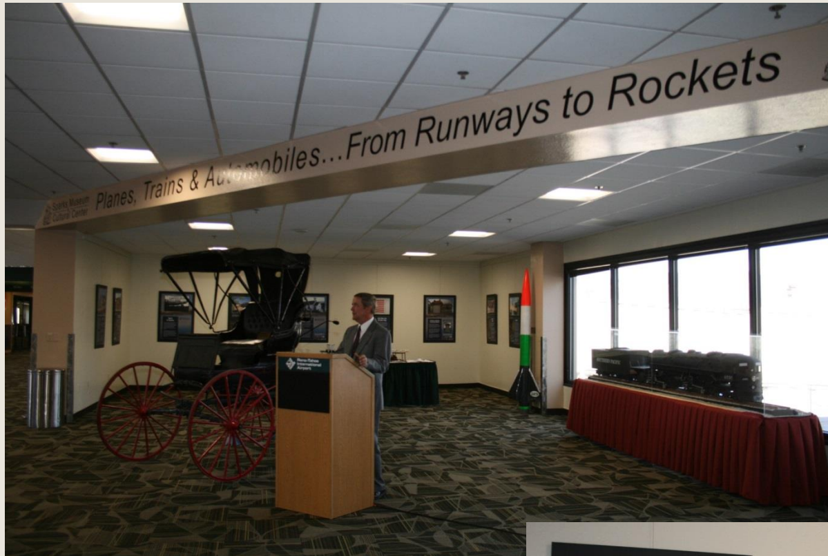
Reno-Tahoe International Airport Exhibit Entrance to C Concourse