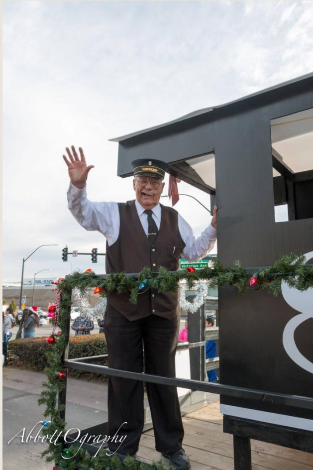
2015 Sparks Hometown Christmas Parade Best Float